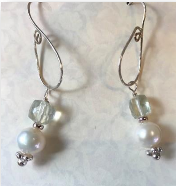
Sterling Silver Earrings by Gigi Goochey