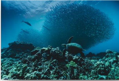
Wood Turner