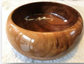
Thomas Carey Photography, Wood Turner