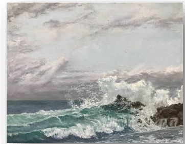
P.L. Hedden Impressionist Painter - Oils