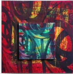
Jennifer Azzarone Image Transfer