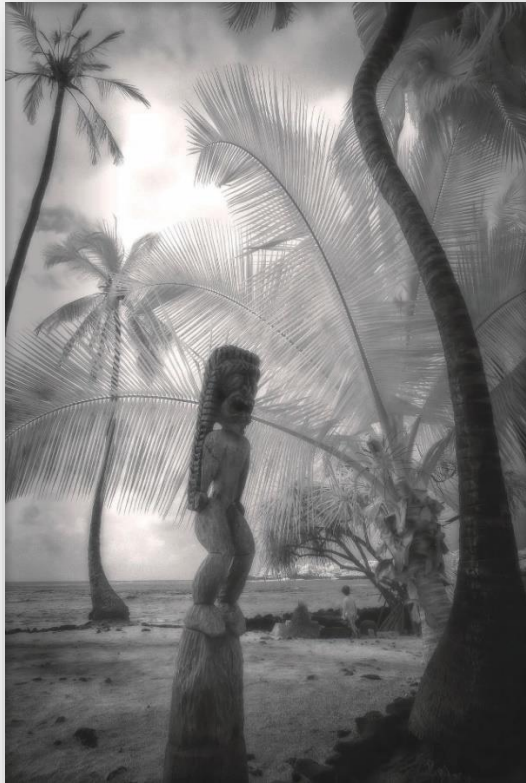
Tiki, Place of Refuge Infrared