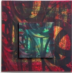
Jennifer Azzarone Image Transfer