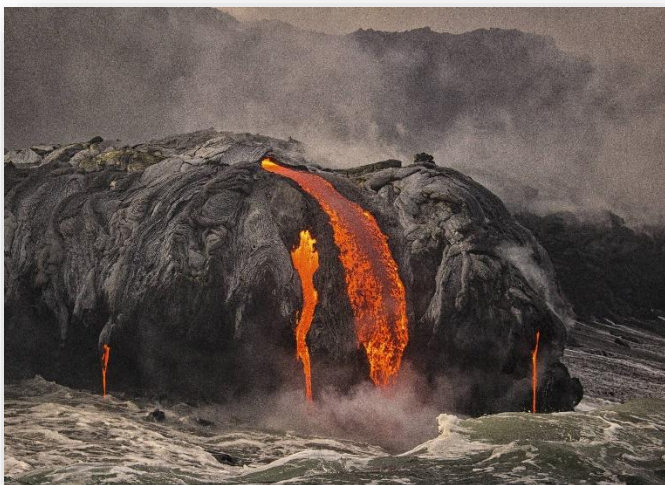
Lava Flow into Ocean Infrared