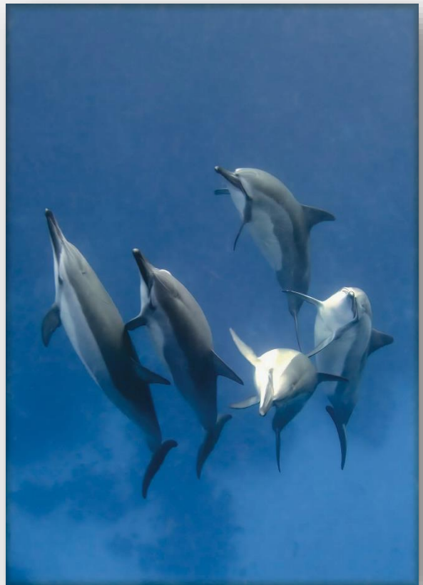
Dolphins Coming Over Infrared