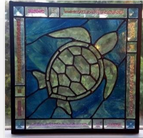
Bill Jaeger Stained Glass