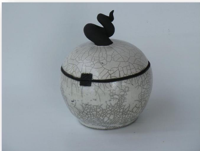
Lidded White Raku Box