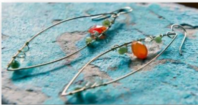
Gigi Goochey Jewelry